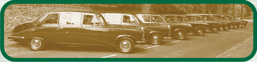
1980 Daimler Limousines