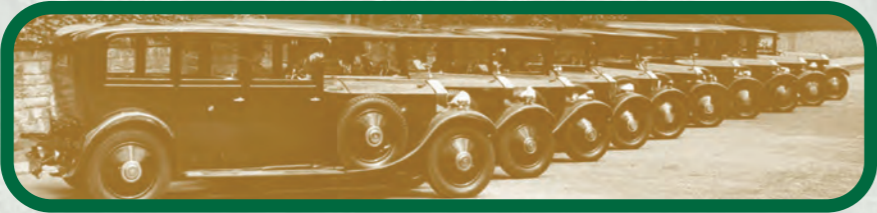
1930 Rolls Royce Limousines