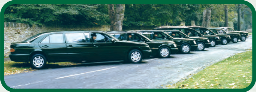
2000 Mercedes-Benz Limousines