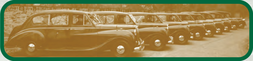
1960 Princess Limousines