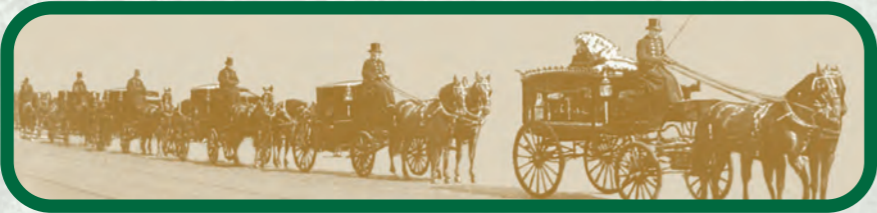
1880 Black Belgian Horses